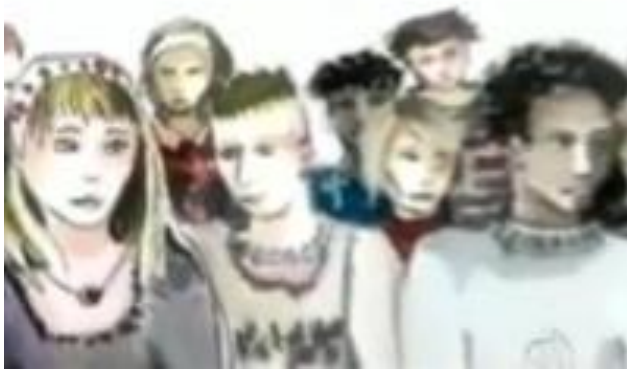
Above: scene from "Probabilidade" ("Probability"), one of the few (or maybe the only) educational film in the world on being bisexual in school