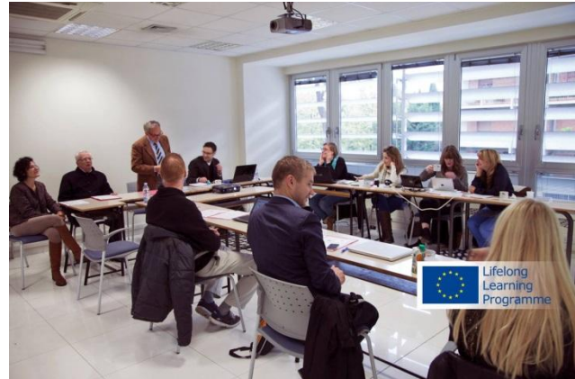
Above: the ARES team discussing how to kick-off the project

of EduDivers, which is active in the Netherlands. The four priorities of the network is to monitor the implementation of the Right to Education, improving the quality and impact of teacher training, stimulating the inclusion of LGBT issues in school policies and improving the quality and impact of storytelling by LGBT volunteer educators.