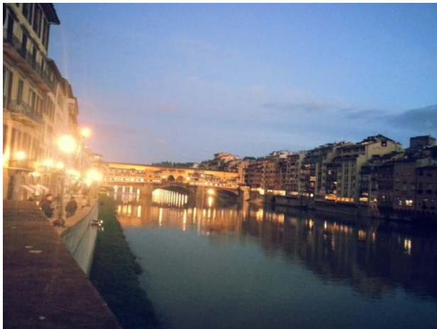
ENFAP, the coordinating partner is located in beautiful Florence

ENFAP is the coordinating partner of the project and is a non-profit organisation belonging to the National Trade Union U.I.L. based in Florence. It has a large range of activities targeted at vocational, education and training, counselling and advocacy for young people and adults. It develops studies, research, information and documenting material as well as offering assistance for workers and enterprises.