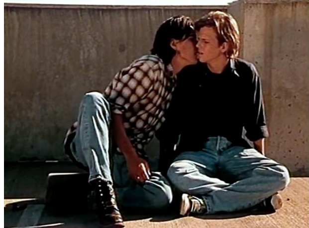
Above: scene from “A Good Son”

ENFAP will present and discuss an anthology of LGBT short movies produced in different countries. This will involve young and adult people from public institutions, high schools and universities. The first dates will be on 14 th and 18 th of April with the presentation of some LGBT short movies during the Spring Festival organised by Montevarchi Municipality.