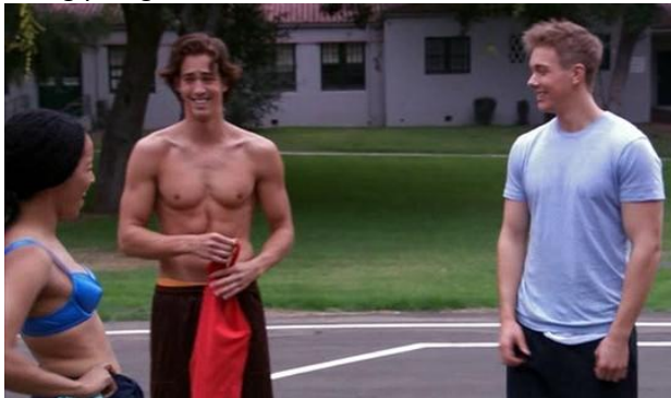
Above: scene from “Latter Days”

The Estonian partner SEKU is organising several movie nights in April and May, in collaboration with other Estonian partners and LGBT organisations. The presentation will include full-length LGBT movies as well as shorter clips. The screenings will be followed by open discussion style workshops focused on the films stories and themes. Two movies that SEKU will be showing are “Bridegroom” (USA 2013) and “Latter Days” (USA 2003). “Bridegroom” tells the true story of a gay couple, how they grew up, lived different lives and what became of them after they met. It is a story of becoming of age, great love and dreadful loss. A similar story is played out in “Latter Days”, a movie about two young men from two completely different worlds meeting, falling in love and their struggles to stay together. It is especially difficult when one of those worlds is a strongly religious one.