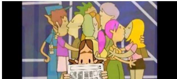
Above: scene from “Mede de quê?” (“Afraid of what?”), a Brazilian educational film which was forbidden to be shown to youth by the Brazilian government

Part of the screenings were 3 video's from Brazil, which had been made by order of the government in the context of the national "Schools without Homophobia" program. Regrettably the Evangelical party in the parliament lobbied the president to forbid the films, because they would "entice young people into masturbation, homosexual behaviour and drug use".