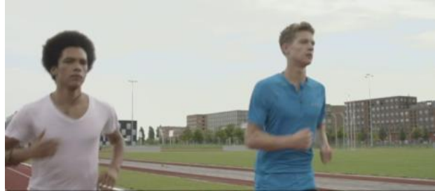
Above: scene from "Caged"

one of them is gay, the heterosexual friend has to decide whether to fall in line with his homophobic peers, or to keep up his friendship. The discussion, was both on the content and on the way the stories were told through the film-making.