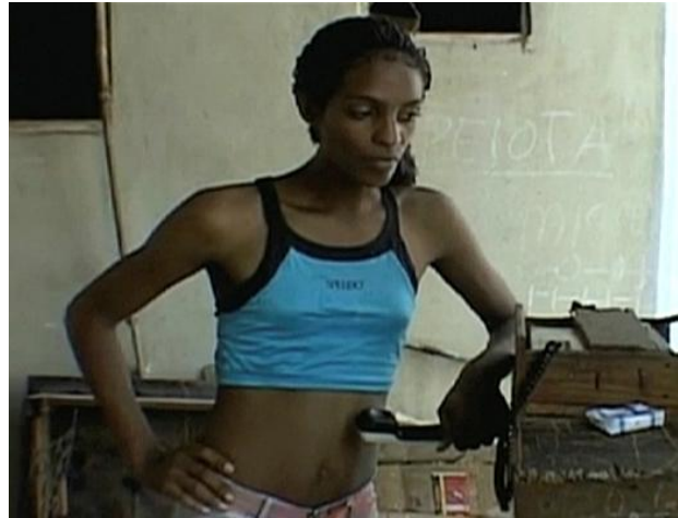
Above: scene from “Cuba and the night”

partners, “learners”, who will travel to the partner countries to participate and review cultural events. Ask your local partner how you can become involved!