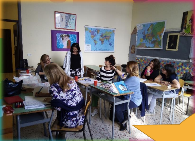
Teacher workshop in a Italian school

The teachers also did workshops. They often wanted to know more about what student really think, what happens online, and how they can help. But they also worry about how to deal with unpleasant behavior in class.