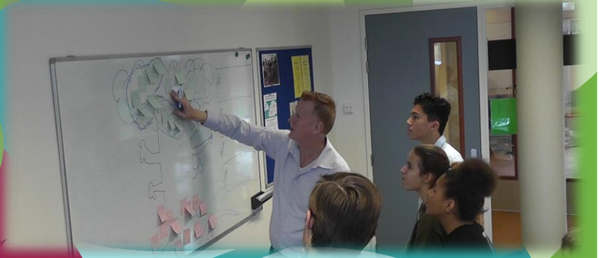
Discussion on priorities in a Dutch school

In a school in Italy, the teachers, students and even parents engaged in a circle discussion called a maieutic or Socratic dialogue. This means that no-one “teaches” but everyone learns from each other knowledge and viewpoints. It is not a “debate” but a way to learn by sharing experiences and to analyze situations together.