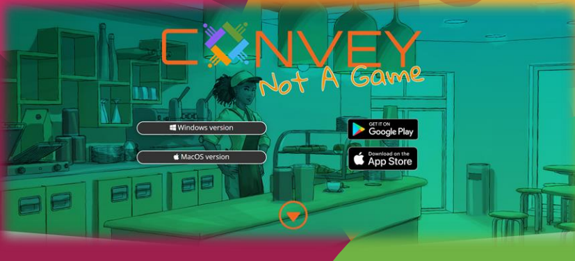
The Convey game

One Italian school also took part in a European project on cyberbullying and stereotyping. They worked together to make an online game on this.